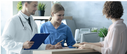
Hospitals and clinics