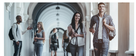
Schools and universities